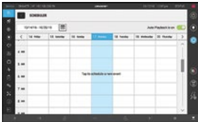
^ Scheduler interface

The CP2308 is equipped with Christie® CineLife™ electronics. Featuring a streamlined UX-inspired interface, CineLife simplifies the playback, scheduling and management of cinema content. The built-in screen management system enables seamless content and booth management, KDMs, playlist scheduling, monitoring and more. Projector setup is quick and easy with the auto-configure feature that automatically adjusts the projectors settings for optimal playback when connecting different sources. Engineered with the operator in mind, the CP2308 is the most user-friendly cinema projector available.