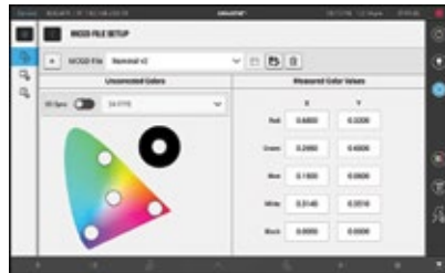
^ MCGD file setup interface